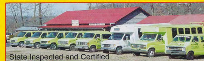
State Inspected and Certified