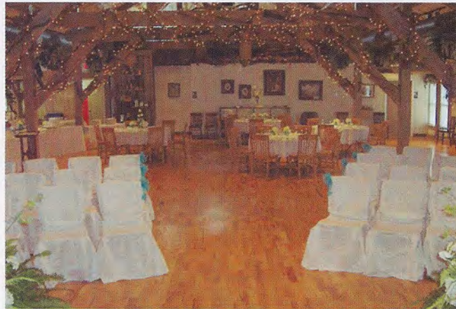
Our Leconte Room can accommodate up to 200 people.

The Barn is more than just an event center, we offer outside catering, decorating services and event planning. Relax and enjoy your event while we take care of the details.